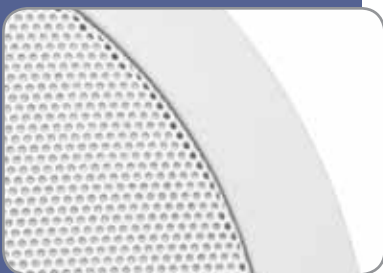
Paintable grille and frame

The crossover network is the speaker's electronic circuitry that splits up the incoming full-bandwidth audio signal and sends the lower frequencies to the woofer and the higher frequencies to the tweeter.