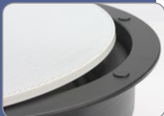
Magnetically attached grilles