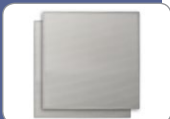
Optional square grilles sold separately

Conventional (Mono) – The dual voice coil woofers and dual 1-inch soft dome tweeters produce superlative sound for standard stereo music reproduction.